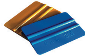
3M™ Hand Applicator PA1-Blue and PA1-Gold Reusable squeegee-type applicator for smoothing film during installs.