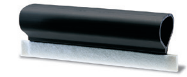
3M™ Power Grip Applicator for 3M™ Comply™ Adhesive Films CPA-1 Covers large areas with uniform pressure distribution.