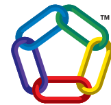
3M™ MCS™ Warranty

The most comprehensive finished graphics warranty in the industry. When you use finished graphics made with all 3M Graphics products and components, you're protected for virtually any application.