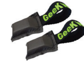
Geek Wraps® Power Slam Magnets Holds film to vehicle during installation without damaging the vehicle or graphics.