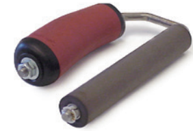
3M™ Rapid Roller Applicator CPA-2 Exclusively for applying 3M™ Controltac™ Graphic Films with Comply™ Adhesive.