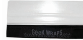
Geek Wraps® Soft Edge Squeegee Micro-fiber edge does not heat up and absorbs water from the edges of film.