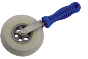
3M™ Textured Surface Applicator TSA-3 Conforms heated film around cut edges and in corners.