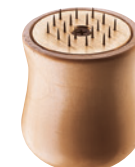
3M™ Power Grip Multi-Pin Air Release Tool MPP-1 Uniquely designed to release the air around rivets in one single motion.