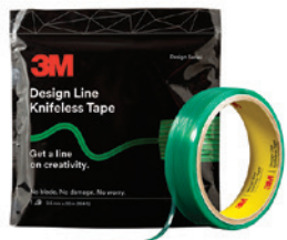
3M™ Design Line Knifeless Tape Engineered to create highly contoured designs with sharp, clean edges.