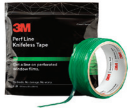
3M™ Perf Line Knifeless Tape Cuts uniform margins between window graphics and rubber moldings.