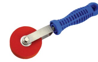
3M™ Textured Surface Applicator TSA-2 Conforms heated film to mortar joints and inside corners.