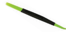
Geek Wraps® Wrap Wand Helps to lay vinyl into tight crevices and score body seams.