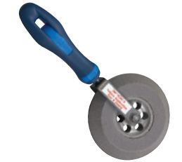
3M™ Vehicle Channel Applicator Tool VCAT-2 Helps to conform film into vehicle channels.