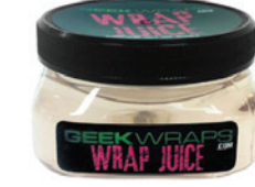
Geek Wraps® Wrap Juice For use with Comply™ Adhesive films to help squeegees easily glide over warmed film.