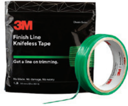
3M™ Finish Line Knifeless Tape Easily cuts most vinyl wrap films — complete installations without a blade.

Get professional results using professional installation tools.