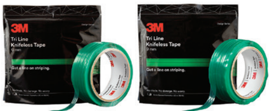
3M™ Tri Line Knifeless Tape (6mm and 9mm) Ensures accurate, consistent stripe width from one end of the vehicle to the other.