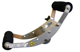
3M™ Two-Handled Textured Surface Applicator TSA-4 for Large Area Increases installation productivity. Requires heat gun (not included).