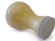
3M™ Power Grip Magic Pad Rivet Applicator CMP-1 Designed for installing 3M™ Controltac™ Graphic Films with Comply™ Adhesive over rivets.