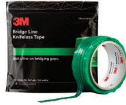
3M™ Bridge Line Knifeless Tape Evenly cuts graphics bridging from one panel to the next.