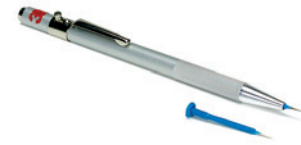
3M™ Air Release Tool 391x Punctures applied film to remove air bubbles.