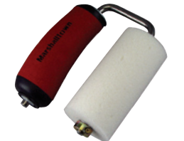
3M™ Textured Surface Applicator TSA-1 Conforms large areas of film onto textured surfaces.