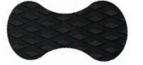
Geek Wraps® Heat Gun Grip Adheres around heat gun body, staying clear of hot sections and exhaust areas.