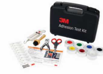
3M™ Adhesion Test Kit for SMOOTH Substrates ATK-1 Instructions, instruments and film samples to perform adhesion value testing.